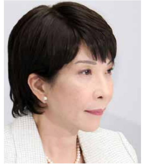
Japanese Premier Sanae Takaichi

In the international arena, this will mean keeping relations with China on a stable footing and avoiding