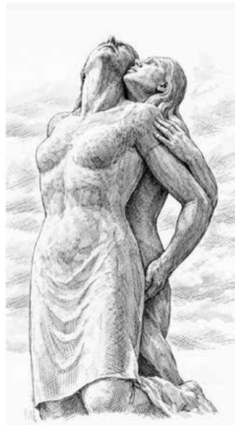
Image of the Monument to the Mother of Ciociaria

The difference lies in the starting point of the memory it embodies. In Rovereto, the Bell was made to commemorate the fallen soldiers of the Great War. In Castro dei Volsci, the narrative was prompted by another wound: the one inflicted on civilians, and particularly on the women of Ciociaria in the latter months of World War II, when the Cassino Front and the Gustav Line turned these valleys into an area of devastation and violence.